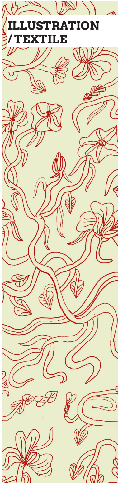
ILLUSTRATION / TEXTILE